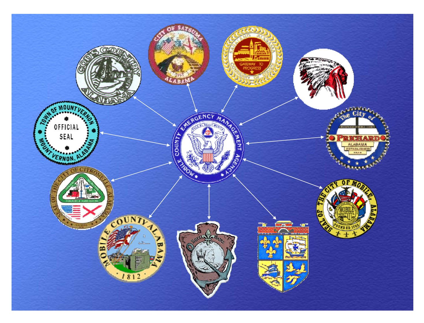
Be Aware and Be Prepared For All Potential Emergencies